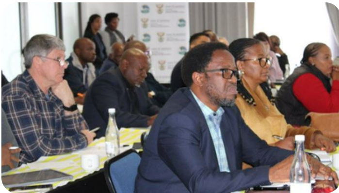
Some of the stakeholders within the municipal jurisdiction of Rustenburg attending a meeting with the Deputy Minister Tshabalala

Some of the outcomes from the previous visits, have given effect to a Technical Committee, which is co-chaired by the Minister for Water and Sanitation and North West Premier to monitor progress on some of the key action plans which are geared at resolving challenges in the medium-to-long term.