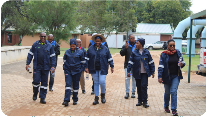
Magalies Water board on a walkabout at the utility's biggest water treatment - Vaalkop during a leg of the Board's tour at the facility.

Magalies Water board collective, undertook a tour of the bulk water provider's assets spread across the Bojanala Platinum District. This tour intended to orientate and provide further insight to the new Board whose mandate started late last year. The tour started in earnest at the water utility's Vaalkop Water Treatment Plant, which is Magalies Water's biggest water treatment facility among the current four water treatment plants (Wallmannsthal, Klipdrift and Cullinan).