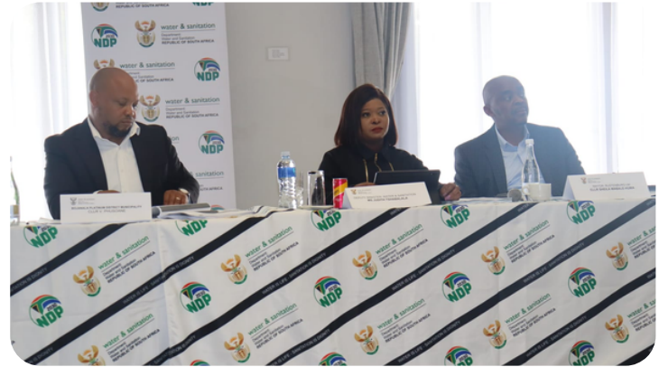
Deputy Minister Tshabalala listens on to deliberations as stakeholders engage on water supply challenges in Rustenburg.

The session which was also attended by various stakeholders including representation from the mining sector and rate-payers associations sought to have an in-depth understanding of relationship between Rustenburg Local Municipality as a Water Services Authority (WSA) and Magalies Water as bulk water provider.