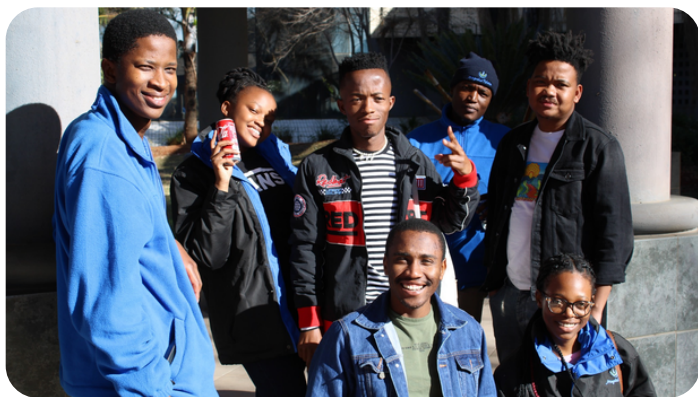
Some of the attendees at the recently launched Young Professional's Forum