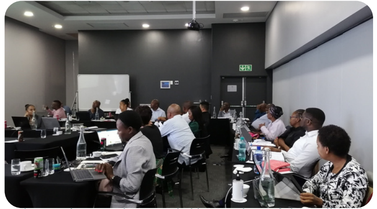
The meeting was also attended by members of the Audit and Risk Committee

These challenges include the escalating debt which largely is due to unserviced debt by municipalities who are registered Water Services Authorities (WSA's) in Gauteng, Limpopo and North West.