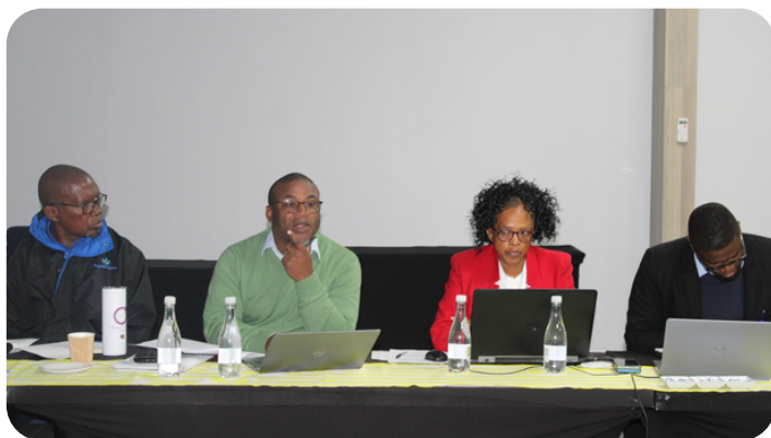
Magalies Water and NMMDM representatives at a special meeting intended to resolve historic debt which has been in dispute for several years and has been transferred to Magalies Water.

The recommendations were that going-forward, the two parties need to establish a task team that would be responsible for ensuring that issues raised were attended to with immediate effect and a proper project plan is put in place to manage progress thereof.