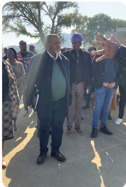
Mineral Resources and Energy Minister - Gwede Mantashe receives briefing at the Brits Water Treatment Plant in his capacity as DDM Champion in Bojanala District

Minister of Mineral Resources and Energy, Gwede Mantashe conducted an oversight meeting at the Brits Water Treatment Works in the North West in his capacity as the champion of Bojanala District Development Model.